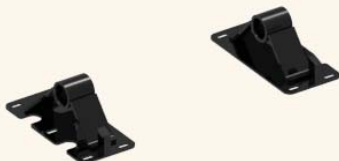
Outboard Plate Mount