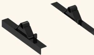
Inboard Angle Mount