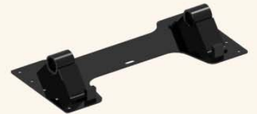
Outboard Flat Plate Mount