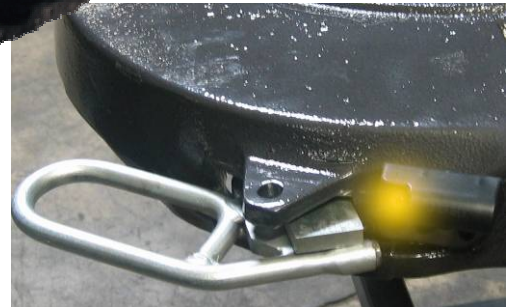
Retractable & Air Release

The LockTronic is a self contained battery powered LED security system that confirms the Fifth Wheel is properly locked.